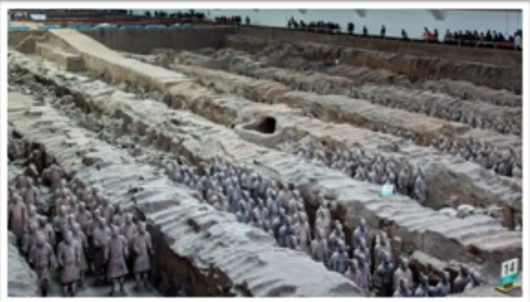
This months pictures are by Alicia Thomas and were taken on a recent trip to China

Book your tickets early using promotion code PAGBTPS16 to claim special PAGB discount. (Choose your tickets and enter the promotion code just before you pay - ticket price will then be £10.95)