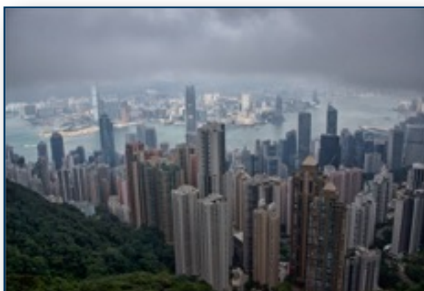
View of the city from Victoria Peak

We would like as many of you as possible to take part so that we can come up with some winning images. It will be held on Sunday May 15th. A map of the area showing the boundaries is at the end of this newsletter.