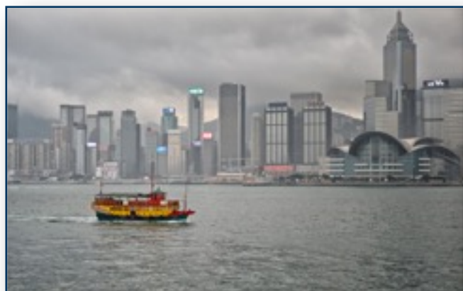
This month's pictures taken in Hong Kong are by Janet Oxenham

Book your tickets early using promotion code PAGBTPS16 to claim special PAGB discount. (Choose your tickets and enter the promotion code just before you pay - ticket price will then be £10.95)