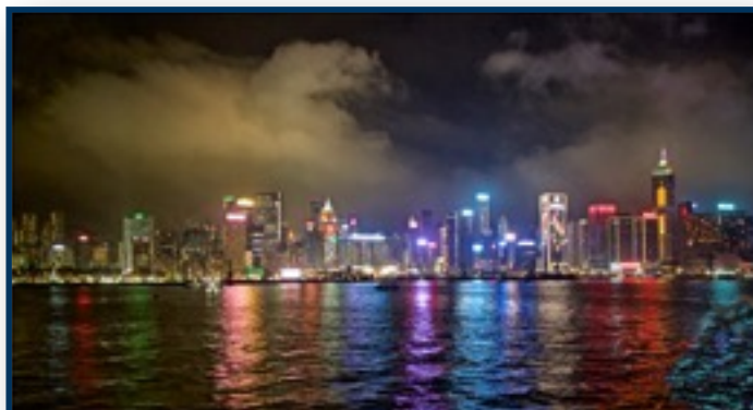
Symphony of Lights, Hong Kong