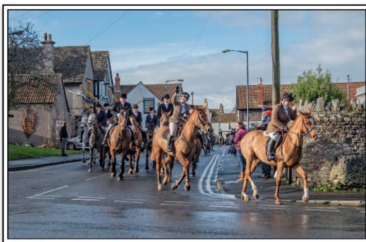
This month's pictures are from the Thornbury Boxing Day Hunt 2017

FULL DETAILS ARE ATTACHED WITH THIS NEWSLETTER.