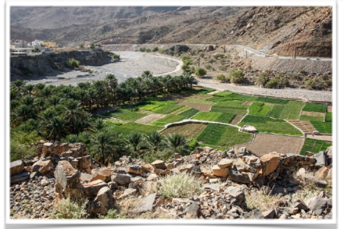
This month's pictures were taken by Mike Ashfield in Oman