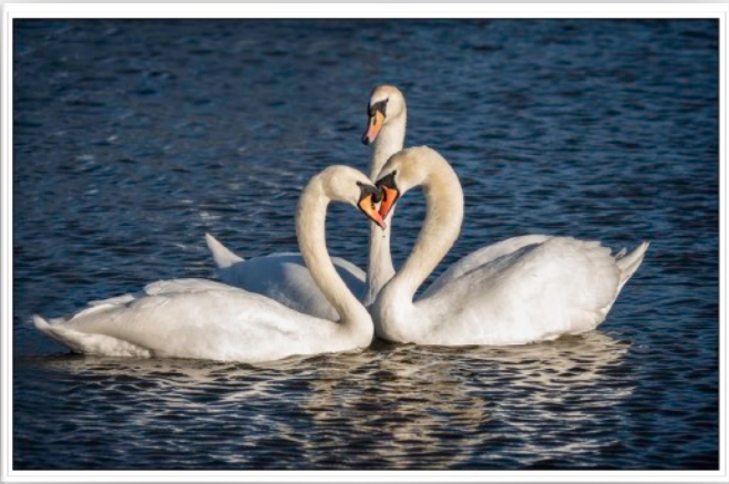
This month's pictures were taken by Janet Oxenham and were taken in Slimbridge

BEGINNERS COURSE TCC is running a Beginners Course from 5th February 2019 to 12th March 2019 - please do what you can to advertise this event in your area