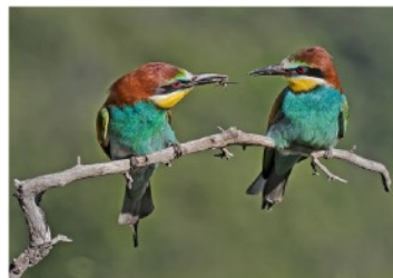
Bee Eaters Sharing by George Collett scored 20