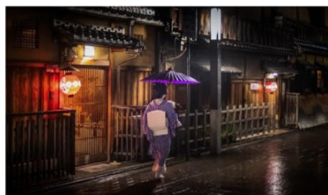
The Geisha of Gion by Dean Packer scored 19