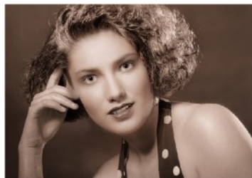
Absolutely Flawless by Rob England scored 19