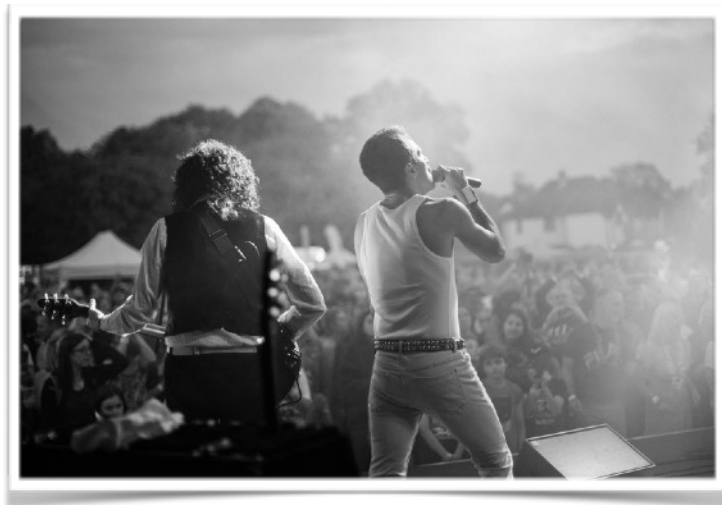
This month's pictures are by Matt Webb - taken at "Mash in the Meadow 2019 Event" and are from a Queen Tribute band called Flash