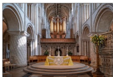
Norwich Cathedral by Janet Oxenham scored 19