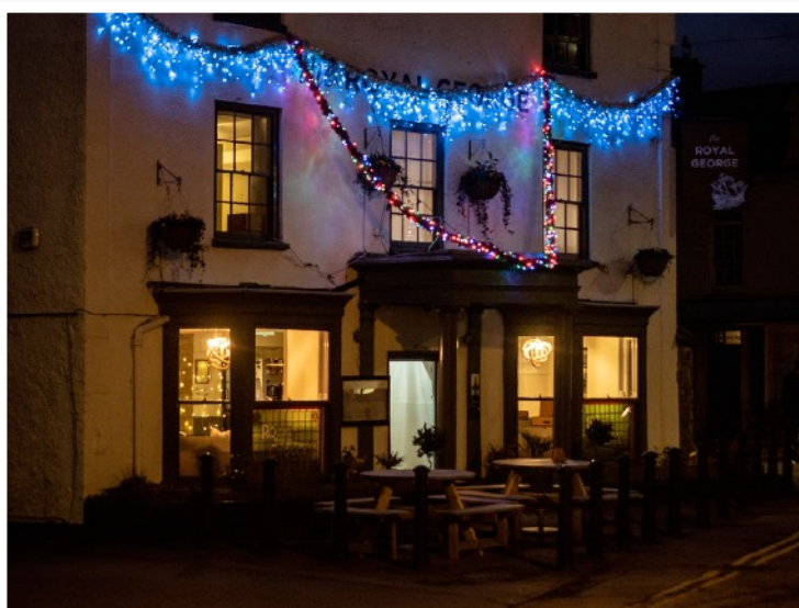
This edition's pictures were taken in Thornbury

Please see page 3 of this newsletter for instructions from Rodney Crabb on how to put a white line around an image using Affinity. Further investigation into loosing quality after saving images when using a plugin, shows that it depends on the compression applied to it. If using Nik software, open settings (bottom left of the Nik window) and click on "image output" the jpeg can be restored to 100% so the original file size will remain or even increase a little due to the edit. However if you are using the Affinity programme, it is probably best to add your white lines as shown on page 3.